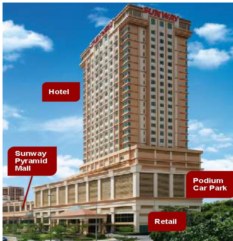
Figure 1: Sunway Clio